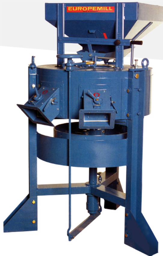
Europemill Horizontal S

The disengaging lever separates the millstones without changing the adjustment. Useful for start and stop operation and for cleaning the mill from stones, metal etc.